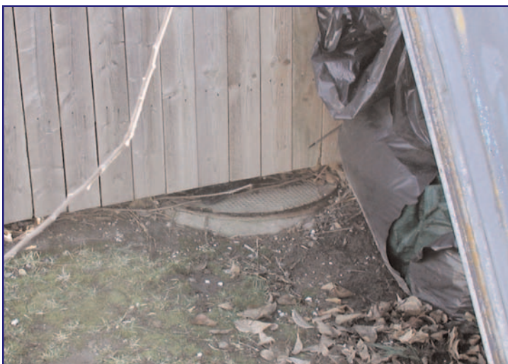
Example of encroachment onto Authority’s easement. Precious time is lost removing obstacles to manholes and sewer lines. Add snow and the manhole becomes very difficult to locate when there is a sewer backup.

For those customers who have sewer manholes in their backyards, you must provide 24 hr., 365-day/year access by Authority personnel. Please keep clear a 5-foot diameter radius around the manhole, and if you have a fenced-in yard, obtain an easement permit if you haven’t applied for one. If you wish to lock your gate for privacy, you can obtain a special lock from the Authority, which gives only you and the Authority access to the yard. This lock can be obtained at the WWTP at no charge.