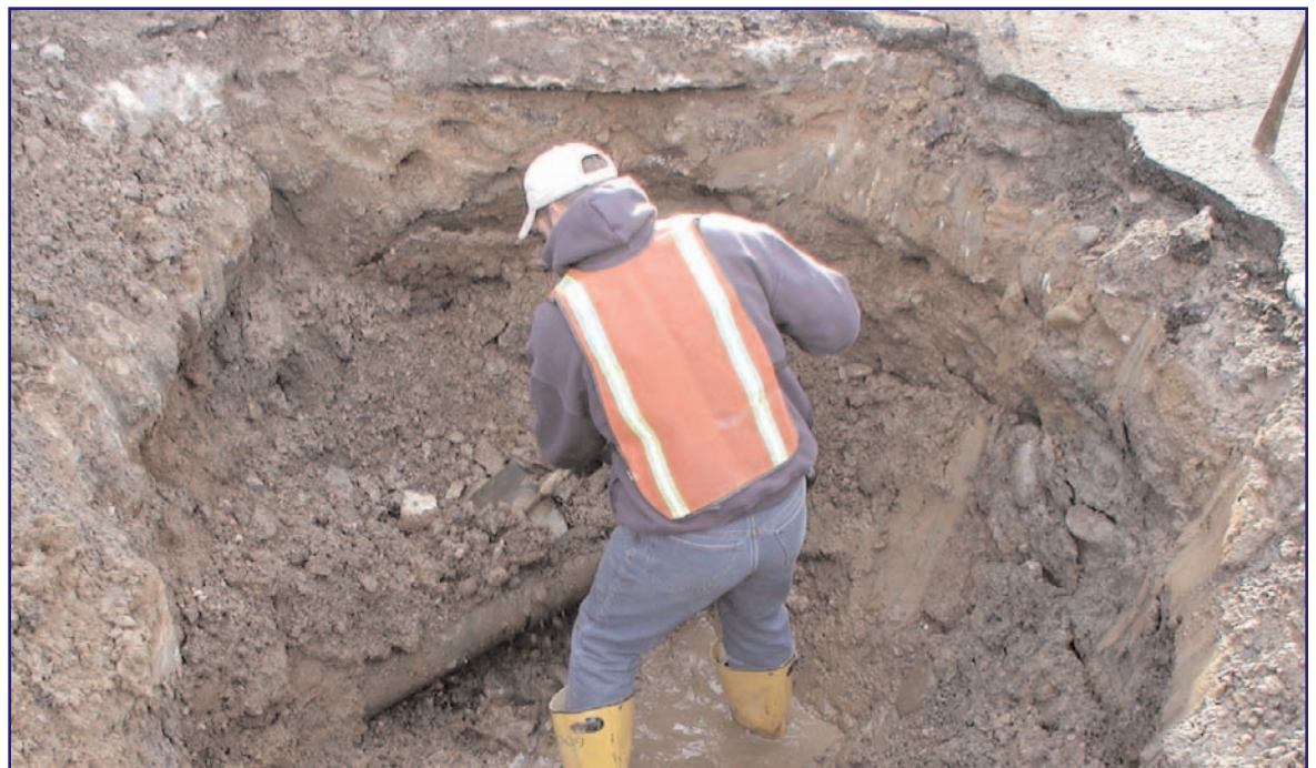
LBCJMA employee preparing to repair a broken water main. This is one of many photos that will be appearing at www.lbcjma.com under our new series LBCJMA at Work . Check it out and learn about us.